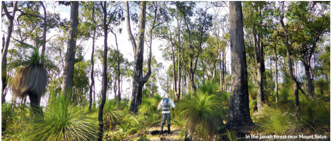
In the jarrah forest near Mount Solus