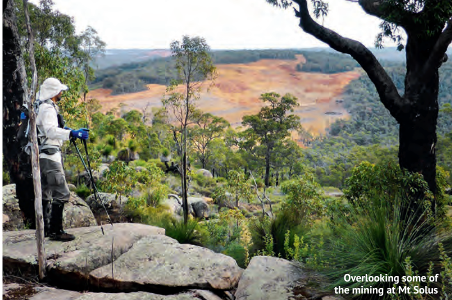
Overlooking some of the mining at Mt Solus

Despite the miner’s claims of global excellence in rehabilitation of mined native forest areas, the reality is that their best efforts remain a long-term experiment with a high risk of an enduring, disastrous environmental outcome for WA’s unique northern jarrah forest. We would be gullible to