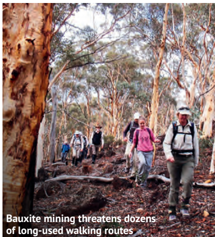
Bauxite mining threatens dozens of long-used walking routes